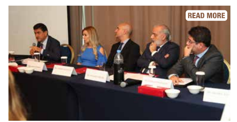
IPTEC Session at IBEF 2018