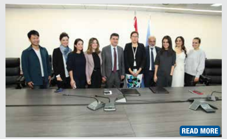
IPTEC - UNDP MoU Signing