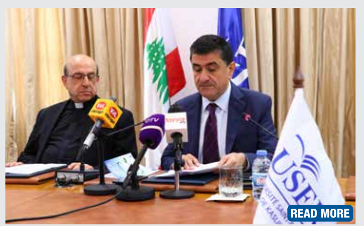
IPTEC - USEK Biodiesel project